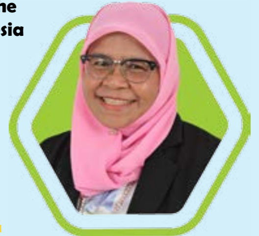
MAEMUNAH MOHD SYARIF Executive Director of UN Habitat