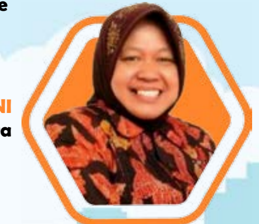
TRI RISMAHARINI Mayor of Surabaya