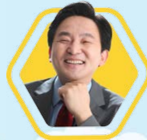
WON HEE-RYONG Governor of Jeju Special Governing Province President of UCLG ASPAC