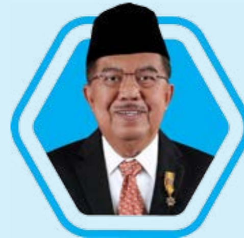
JUSUF KALLA Vice President of the Republic of Indonesia